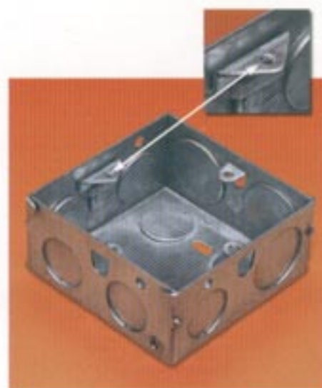
With One Adjustable Lug