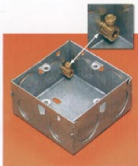
With Brass Earth Terminal