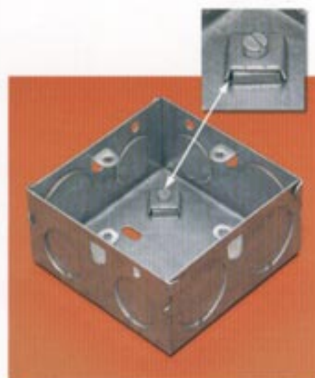
With Steel Earth Terminal