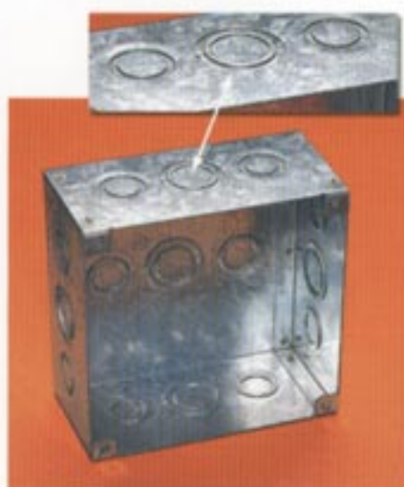
Double & Triple Knockouts